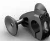
Crossbar/camber tube bracket set