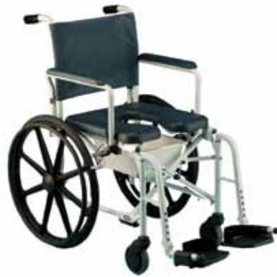
6895: 23" treaded urethane tires with 18" seat