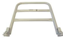
ESR-2478 Side Support Rail