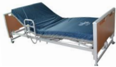
ETUDE-HC BED PACKAGE ETUDE-3080-H