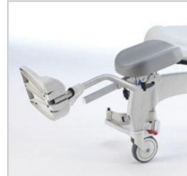
LEGREST COMPLETE AP1643572 - LEFT AP1643543 - RIGHT