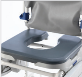
VARIABLE SOFT SEAT SET COMPLETE (GREY) 1544469