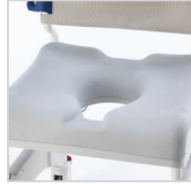
SMALL SOFT SEAT AP1603145