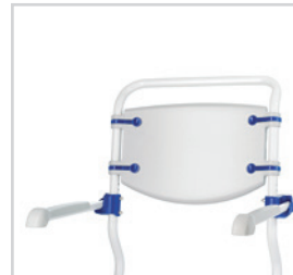
HYGIENE BACK 1575299