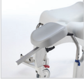
AMPUTATION SUPPORT AP1643573 - RIGHT AP1643574 - LEFT