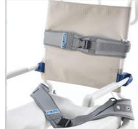
CHEST BELT PADDED w/ STAINLESS HARDWARE 1470081