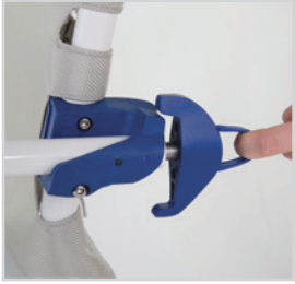
ARMREST LOCK 1470077