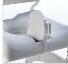
SPLASH SHIELD AP1603155