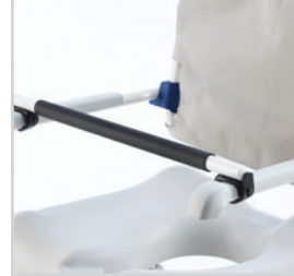
SAFETY SUPPORT BAR 10167-10