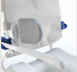
LATERAL SUPPORT 1535077