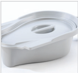
COLLECTION PAN WITH LID 10230