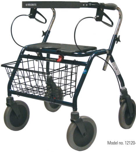
Model no. 12120-37-746