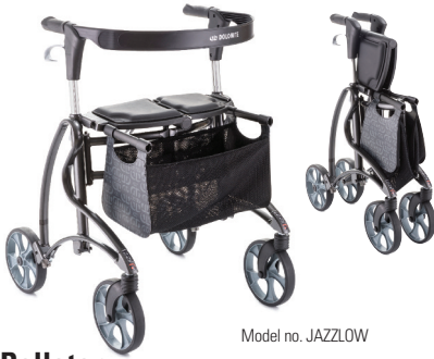
Model no. JAZZLOW