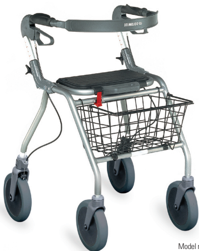
Model no. 12160