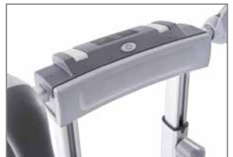
Comfortable cushioning for resting the operating unit on the thigh while climbing the stairs