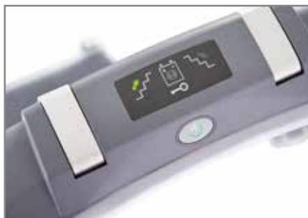
Display showing all functions at a glance