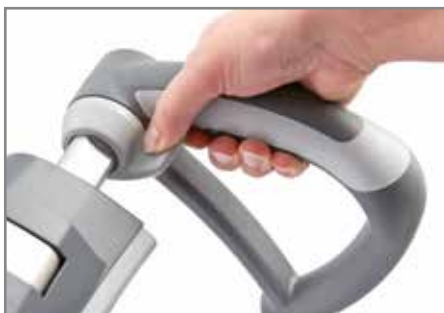
ErgoBalance grips: non-slip with a convenient shape

scalamobil and scalacombi adapt to your needs – not the other way around. The grip unit can be adjusted in height and width and thus adapts optimally to the person operating it and to the stairs.