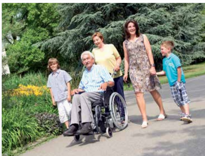
Safety and comfort even on downward slopes.

We ensure mobility. Whatever the situation.