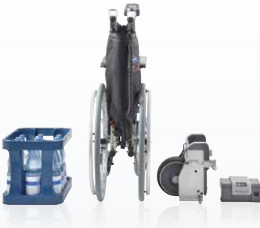
viamobil – small, light, handy and easy to transport

Transporting viamobil is easy and convenient, even in fairly small cars. The individual modules are light and sturdy and have useful carrying handles for quick stowage. No tools or prior manual skills are required to remove viamobil, stow it away in a small space along with the wheelchair and then get it ready for operation again in a few easy steps. This allows you to be mobile simpler and faster.