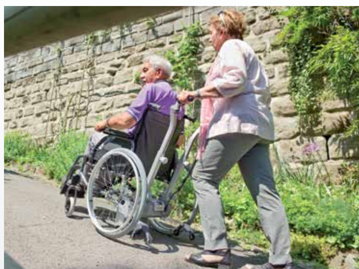
Mastering uphill inclines without any difficulty.