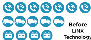
Before LiNX Technology

Thanks to LiNX Technology, a connected AVIVA Storm RX Power Wheelchair can transmit vital diagnostics through the Cloud to the MyLinX™ Provider Portal, meaning you can troubleshoot issues remotely, minimize unnecessary service calls, trips and more.