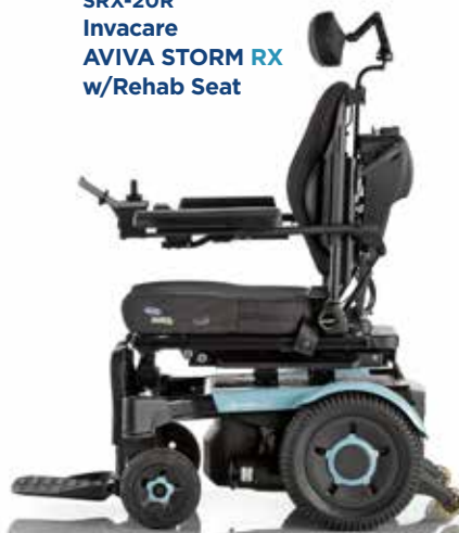
K0848* SRX-20R Invacare AVIVA STORM RX w/Rehab Seat