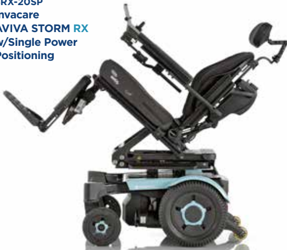
K0856* SRX-20SP Invacare AVIVA STORM RX w/Single Power Positioning