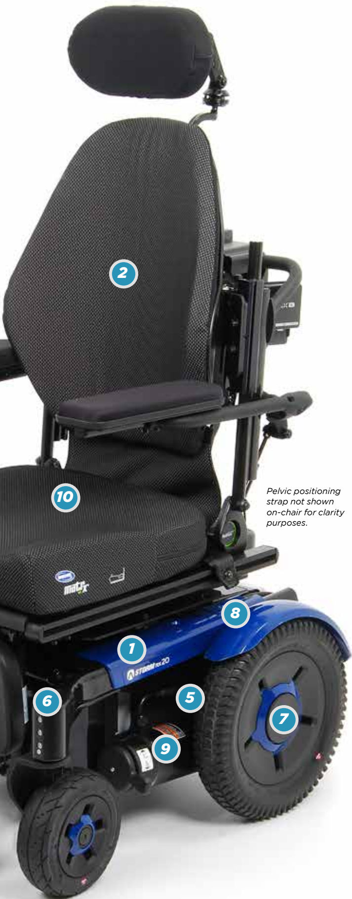
Pelvic positioning strap not shown on-chair for clarity purposes.