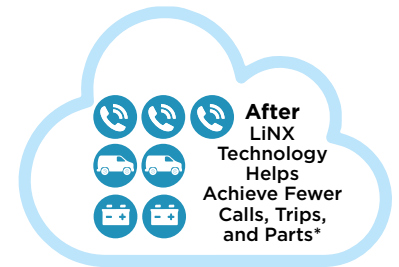
After LiNX Technology Helps Achieve Fewer Calls, Trips, and Parts*