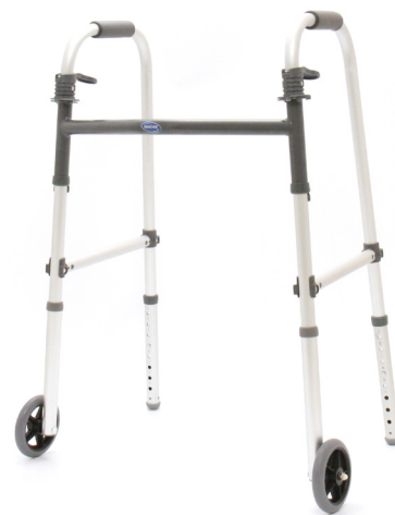
6291-5F: Dual-Release Adult Paddle Walker with 5" Wheels

The Invacare® Heavy-Duty Dual-Release Paddle Walker is strong, stable and simple to use, designed to help individuals to walk with confidence and ease. This walker also is compatible with Invacare leg accessories.