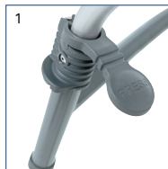
1. Dual Release Paddle button (model 6291-HDA)