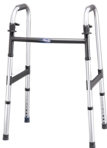
6291-A: Dual-Release Paddle Adult Walker