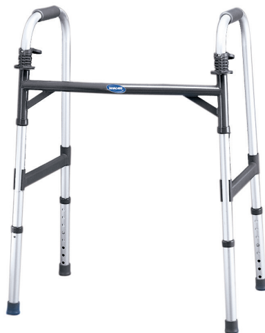
6291-HDA: Heavy-Duty Dual-Release Adult Walker