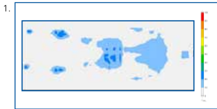
1. Test shows subject in supine position demonstrating contact measurement between key pressure points using Boditrak mapping technology on the SPS1084 support surface. Subject: Male 5'11", 185 lb.